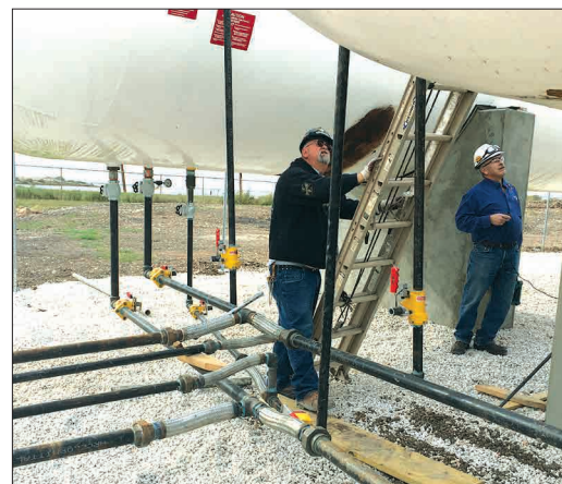
Anhydrous ammonia facilities and anhydrous ammonia mobile equipment are both covered in the ResponsibleAg assessment checklist.

Approximately 30 percent of the more than 400 questions in the ResponsibleAg assessment involve documentation. The assessment covers safety, health, environment and security regulations that apply to 17 areas commonly found in retail facilities.