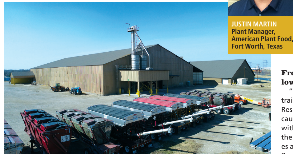
APF is a leader in producing ammonium sulfate-based blended fertilizers, marketing thousands of tons annually throughout North, Central and South America.

By following a systematic approach, members will improve their efforts to properly store and handle farm input supplies, keeping employees, customers and their communities safe.