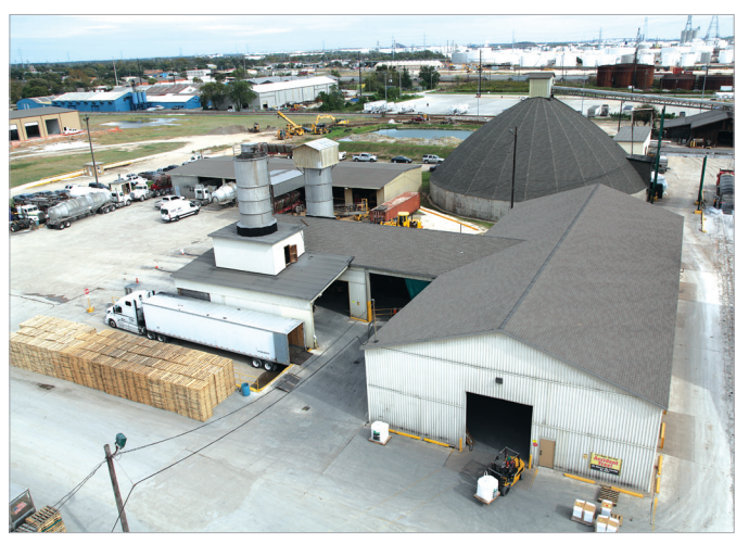
APF is headquartered in Houston, Texas. Safety is paramount at the 11 dry-blending locations it operates throughout Texas.

After reviewing the assessment checklist and making initial corrections at the facility, an auditor is selected from an